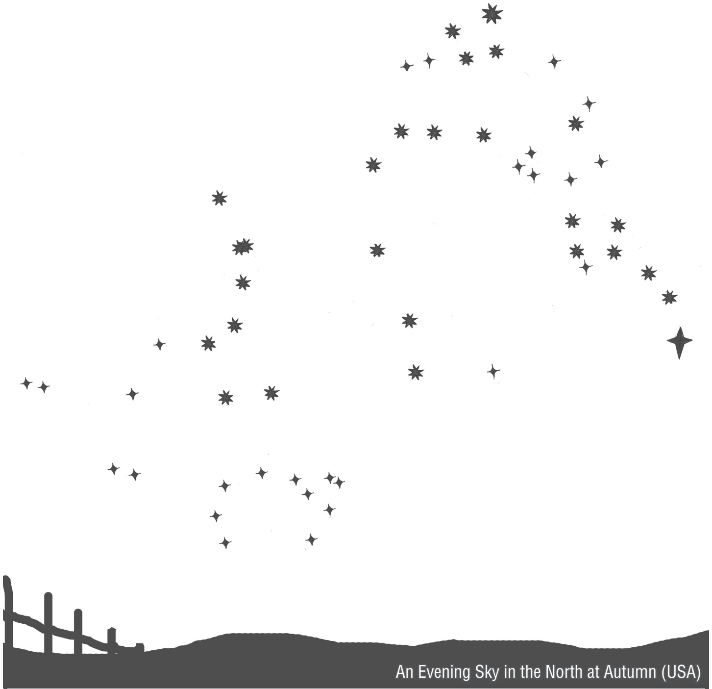
An Evening Sky in the North at Autumn (USA)